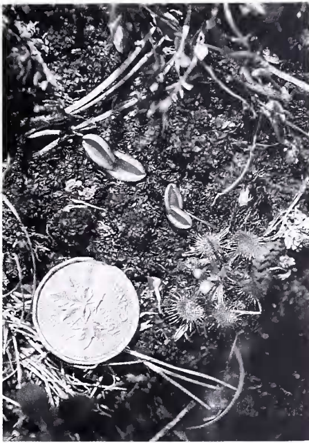
Basal rosettes in Sphagnum moss with D. rotundifolia .